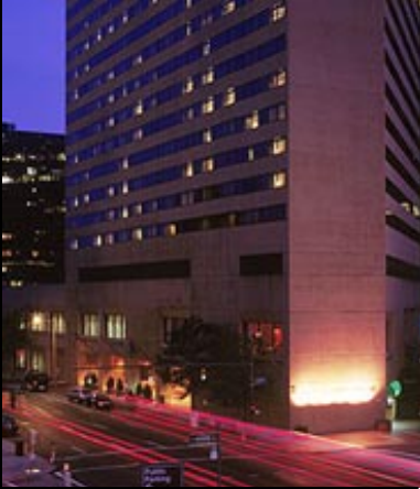
Hyatt on Capitol Square 75 East State Street Columbus, Ohio